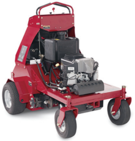
30" Stand-On Aerator