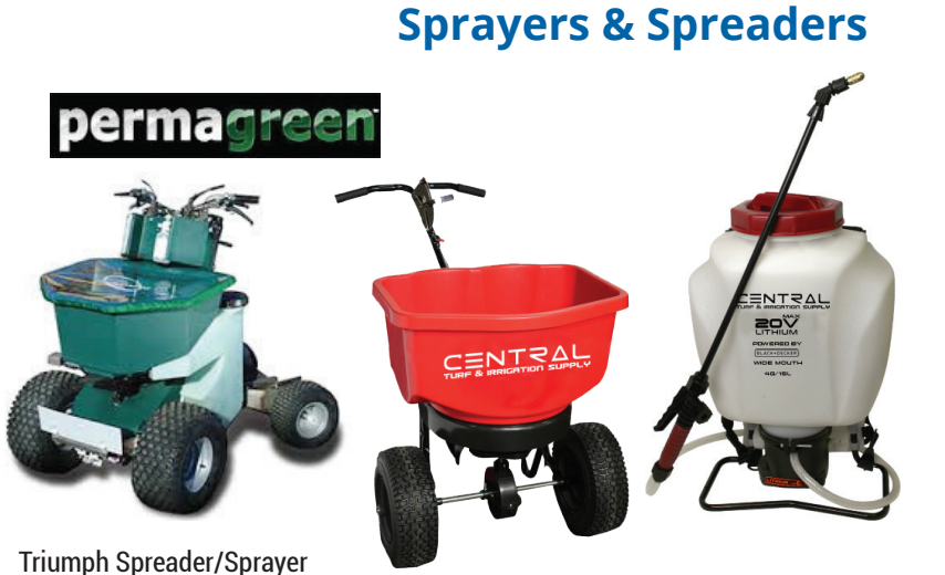
For more information, please contact your local representative.