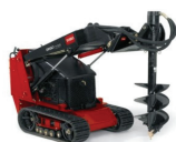
Swivel Auger Head