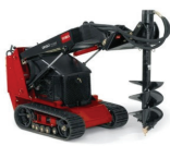
Swivel Auger Head