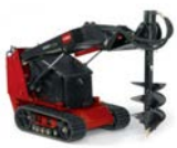
Swivel Auger Head