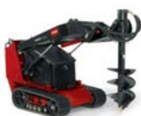
Swivel Auger Head